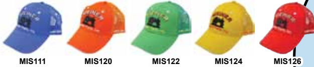
MIS111 MIS120 MIS122 MIS124 MIS126

A great way to show your fellow tractor enthusiasts that you are a part of "Team Steiner!". Each hat is made of durable cotton with real embroidery. Includes STEINER name in raised letters, slogan & contact information.